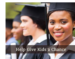
Help Give Kids a Chance

Kids' Chance Washington is a volunteer organization, and your help is critical to our success. If you are interested in volunteering for a fundraising event or becoming more involved, please send an introduction to kidschancewa@gmail.com